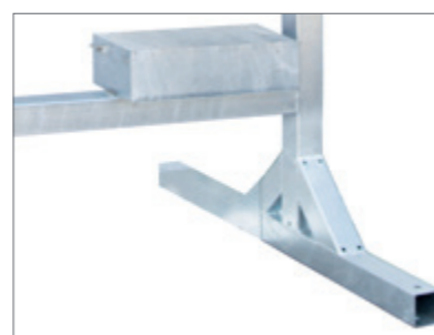
Solid frame for easy installation.