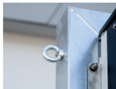
2 pcs. handling brackets (right/left)