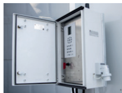
Control unit incl. G.T.M.S.